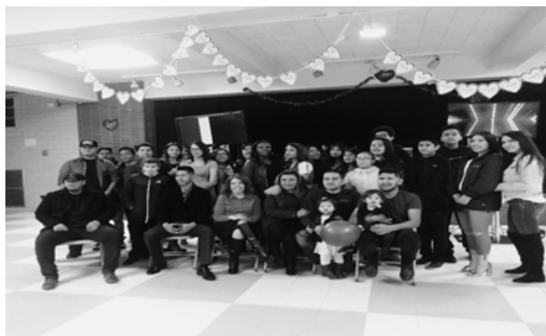
We do many activities in our community.

Give me back the joy of your salvation. Devuélveme la alegría de tu salvación.